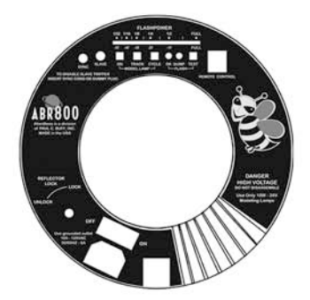
AlienBees ABR800 Ringflashes